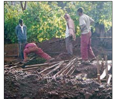
Construction started in earnest after the rainy season ended. Workers began laying out logs to cross muddy trenches.

Construction on Phase I of the Orphan Care Village is expected to be complete by May 2009.