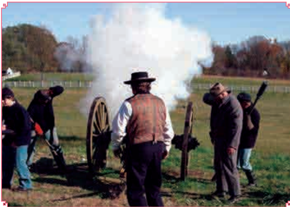
Civil War reenactors fire the cannon. For a small donation, visitors were able to fire a cannon themselves. The booming of the cannons were heard throughout Elizabethtown.