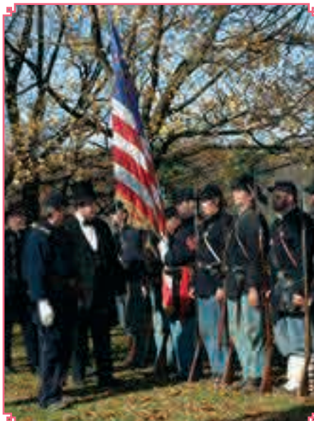
President Lincoln reviewing the troops.