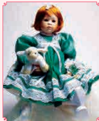
"Kathleen" is one of many beautiful dolls for sale.

100% of the proceeds from the sales go to Brittany's Hope Foundation to sponsor special needs children.