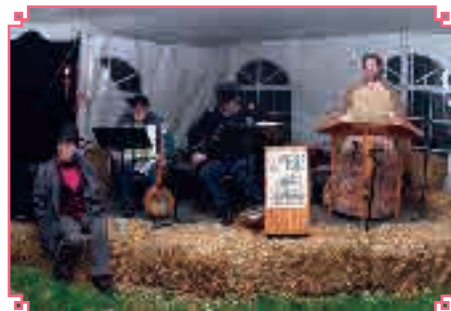
Musicians gearing up for the Friday evening outdoor ball.