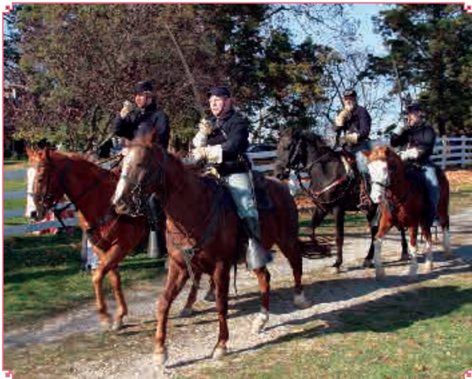
Swords drawn, officers arrive on horseback in preparation for the battle reenactment.