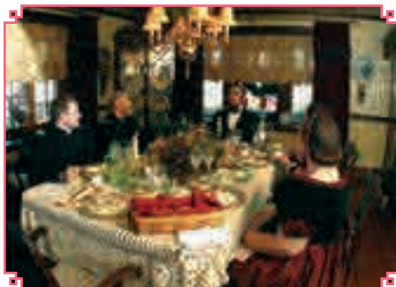
President Abraham Lincoln and First Lady Mary Todd Lincoln were served dinner with officers in the formal dining room.