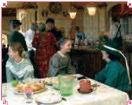
These ladies enjoyed a simple holiday meal.