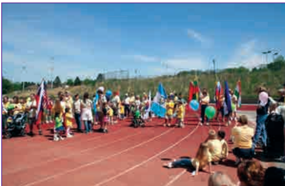
Families joined the Flag Parade; every country Brittany’s Hope children were born in was represented to honor the childrens’ heritage.

We are very grateful to all the people who participated in the walk either by aiding in the organization of the event, donating items for the day, walking themselves or sponsoring someone who walked. I believe all who participated will agree it was a blessing to be part of this event and hopefully will return next year to participate in the 2007 Walk of Love. You as supporters of Brittany’s Hope, play an important roll in aiding in the adoption of special children all over the world. We could not do what we do without your help. You are changing lives. Our mission at Brittany’s Hope is to save children, one child at a time. With the money raised through the Walk of Love we will be able to grant at least 5 children in hopes of helping them to find forever families to call their own. ::