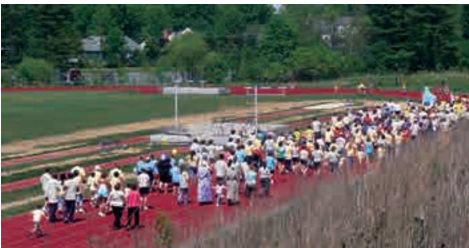
Two hundred and seventy two people walked.