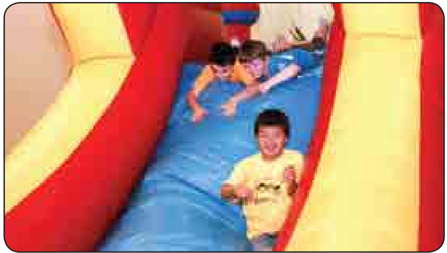
The giant inflatable slide was a popular attraction!

Together we've raised over $32,000 and more donations continue to arrive daily. Thank you to everyone who attended or supported the Walk of Love!