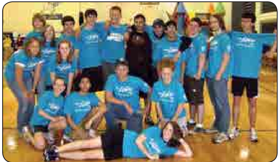
A group of enthusiastic Donegal High School students formed a team to participate.