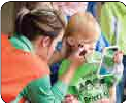
The kids loved getting their faces painted.