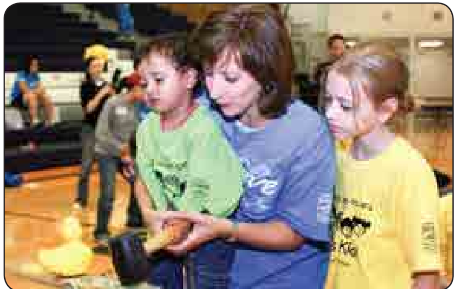
The games included a frisbee and foam noodle throw, mini-putt golf, Make the Rubber Duck Fly, a lollipop tree, and bean bag tossing. Everyone received prizes such as Mardi Gras beads, pinwheels, mini-frisbees, bouncy balls, koosh animals, and squeeze toys.