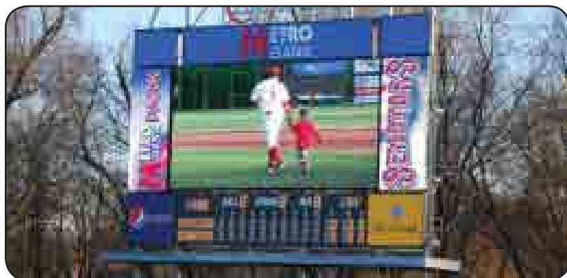
Children of Brittany's Hope supporters were escorted onto the field by the Senators' team.