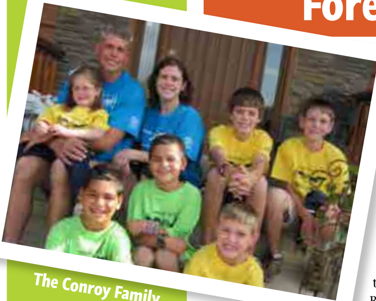
The Conroy Family